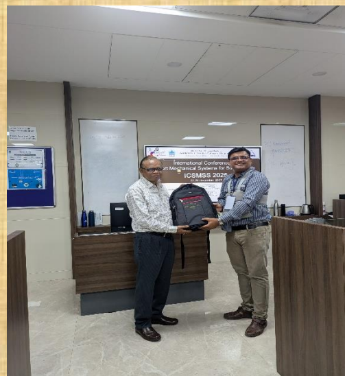
Session chair in International Conference at D. J. Sanghvi college of engineering